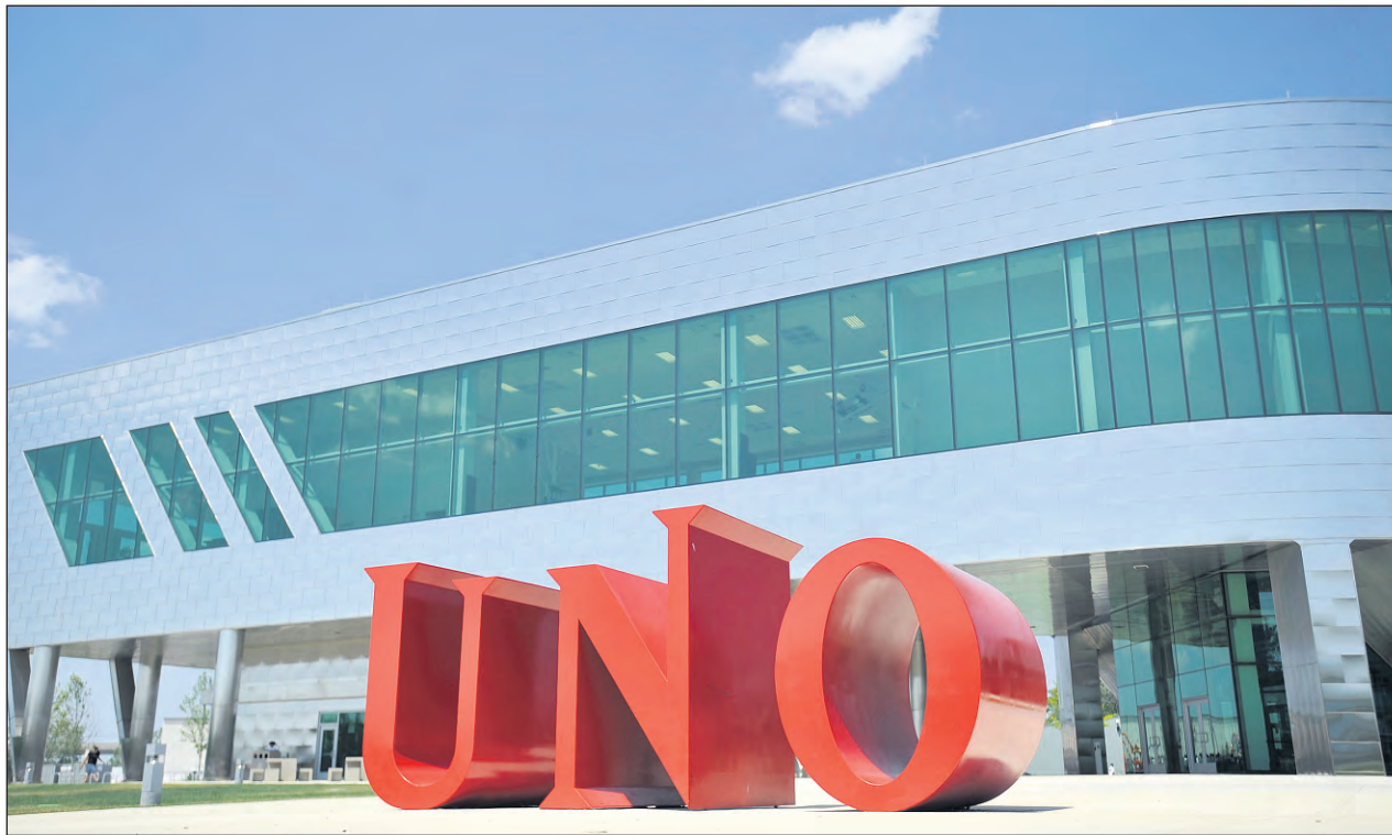
UNO Soccer Academy Elementary Charter School stands out in the Southwest Side neighborhood.