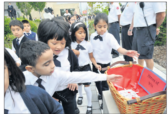
UNO charter school students line up.