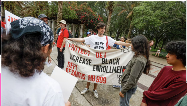
Protesters at the University of South Florida in Tampa rallied in April 2023 against Gov. Ron DeSantis' push to ban diversity programs at state colleges and universities, a proposal that later became law. USF officials said Monday that the university would remain diverse despite the law's provisions.