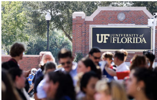
The University of Florida announced Friday it has ended all spending on diversity, equity and inclusion efforts in response to new state policy.