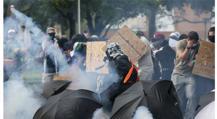
A pro-Palestinian protester returns a tear gas canister toward police after it was fired at a group of protesters at MLK Plaza at the University of South Florida in Tampa on Tuesday.