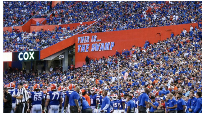
A view of Ben Hill Griffin Stadium during a game between the University of Florida and Utah on Saturday, Sept. 3, 2022 in Gainesville. The NAACP is urging student-athletes to "reconsider" offers to go to Florida schools, citing a new state law that targets spending on diversity programs.